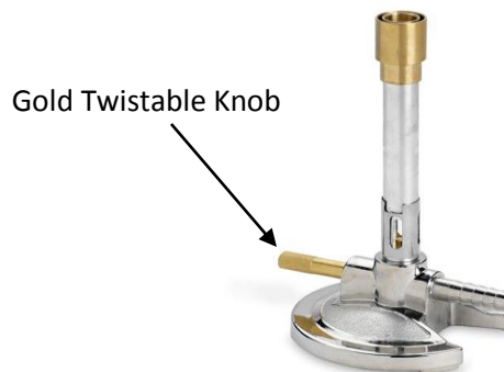
Gold Twistable Knob